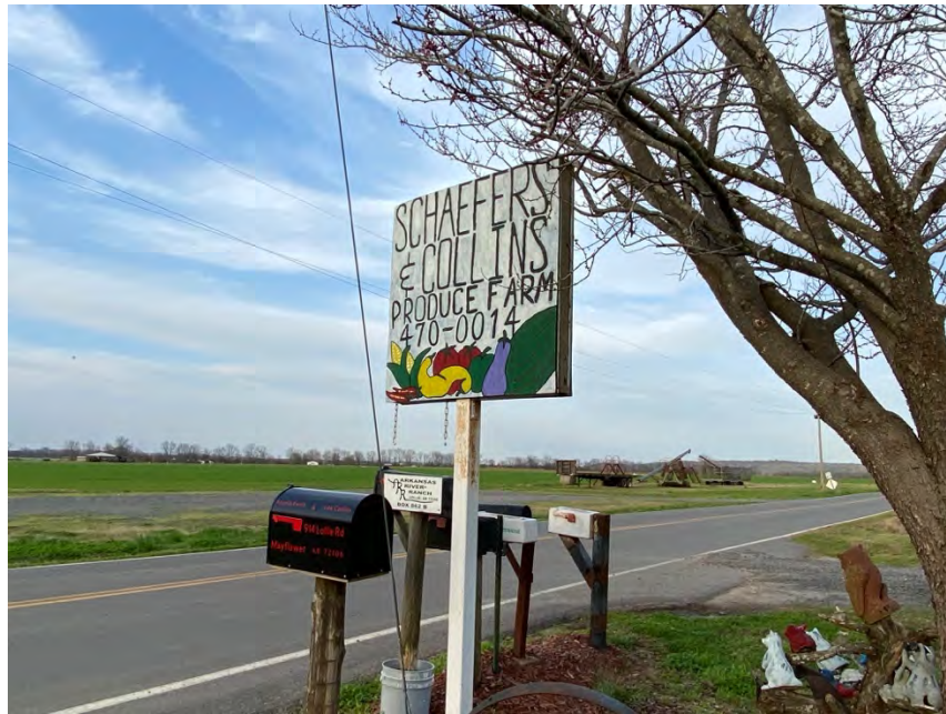
Field is the former location of enslaved cabins and cemetery