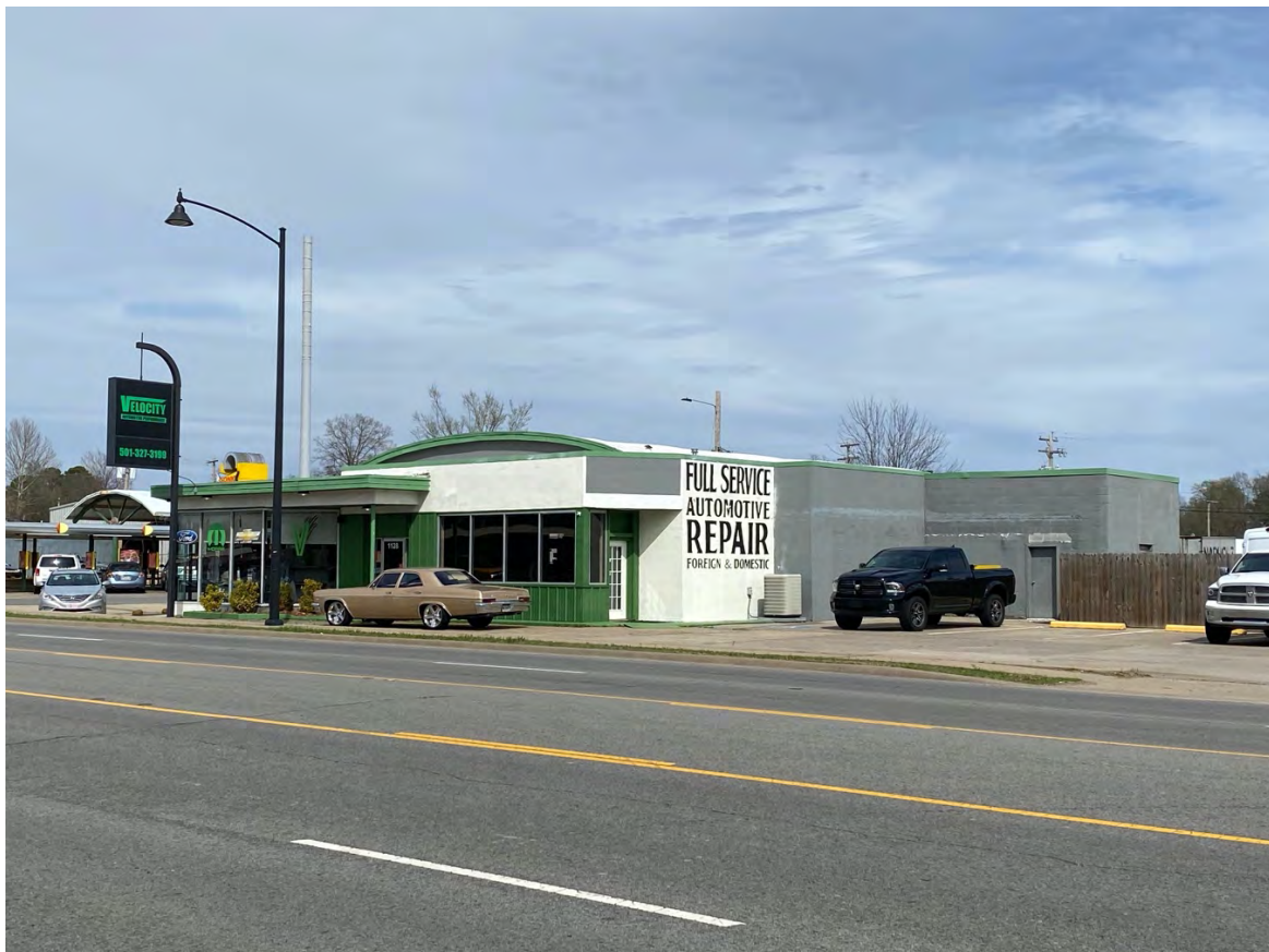
Windshield Survey - Former Beacon Tire