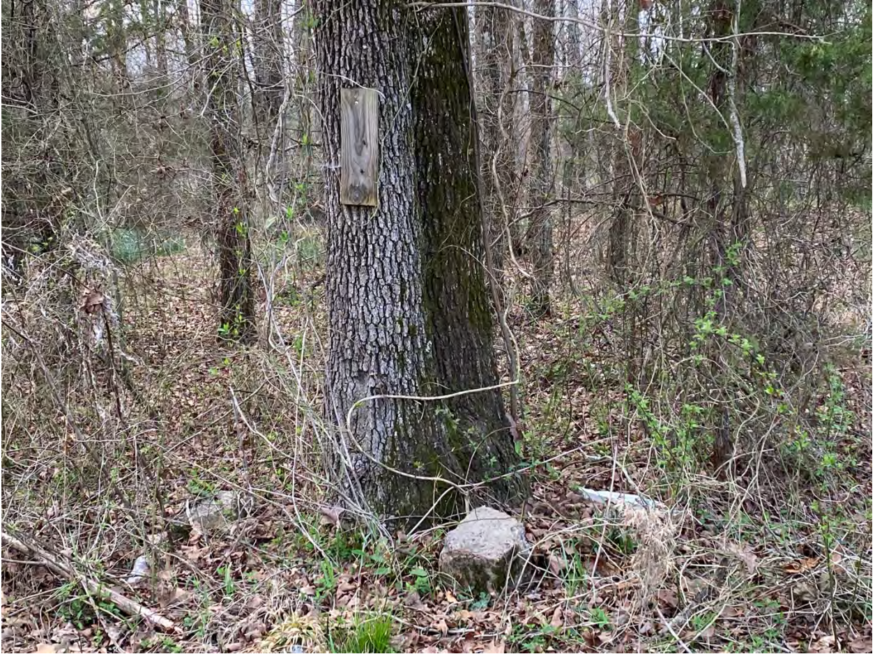
Tree with marker that caught my eye