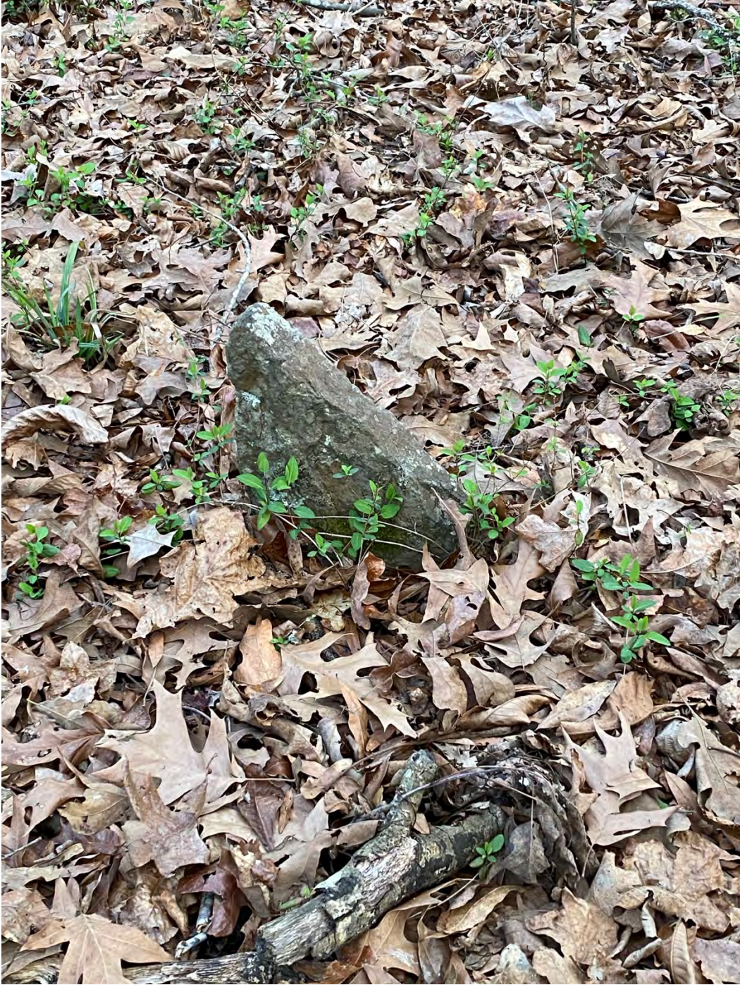
Stone grave markers