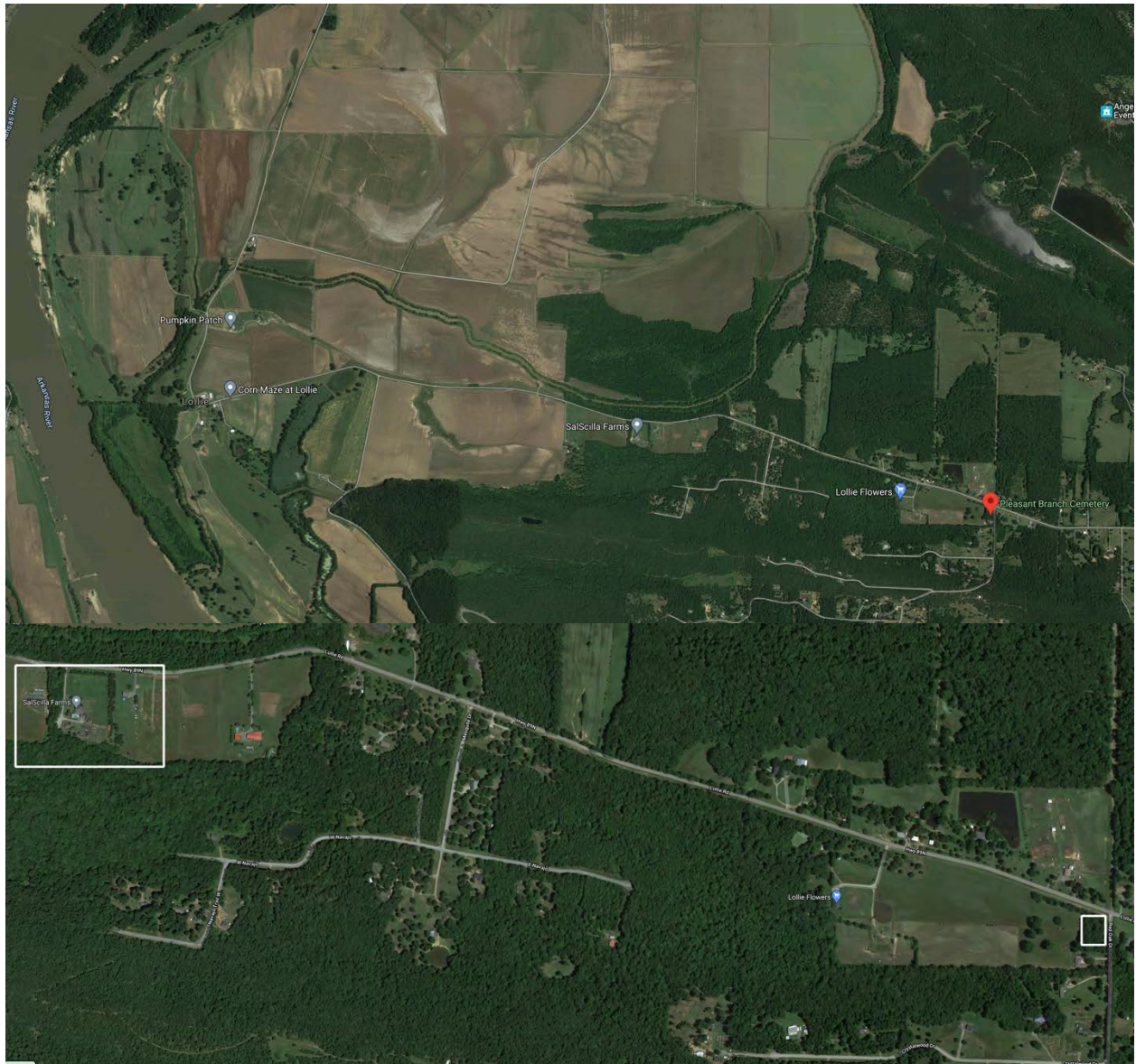
Location of cemetery in reference to former Lollie Bottoms Plantation and Salscilla Farms location