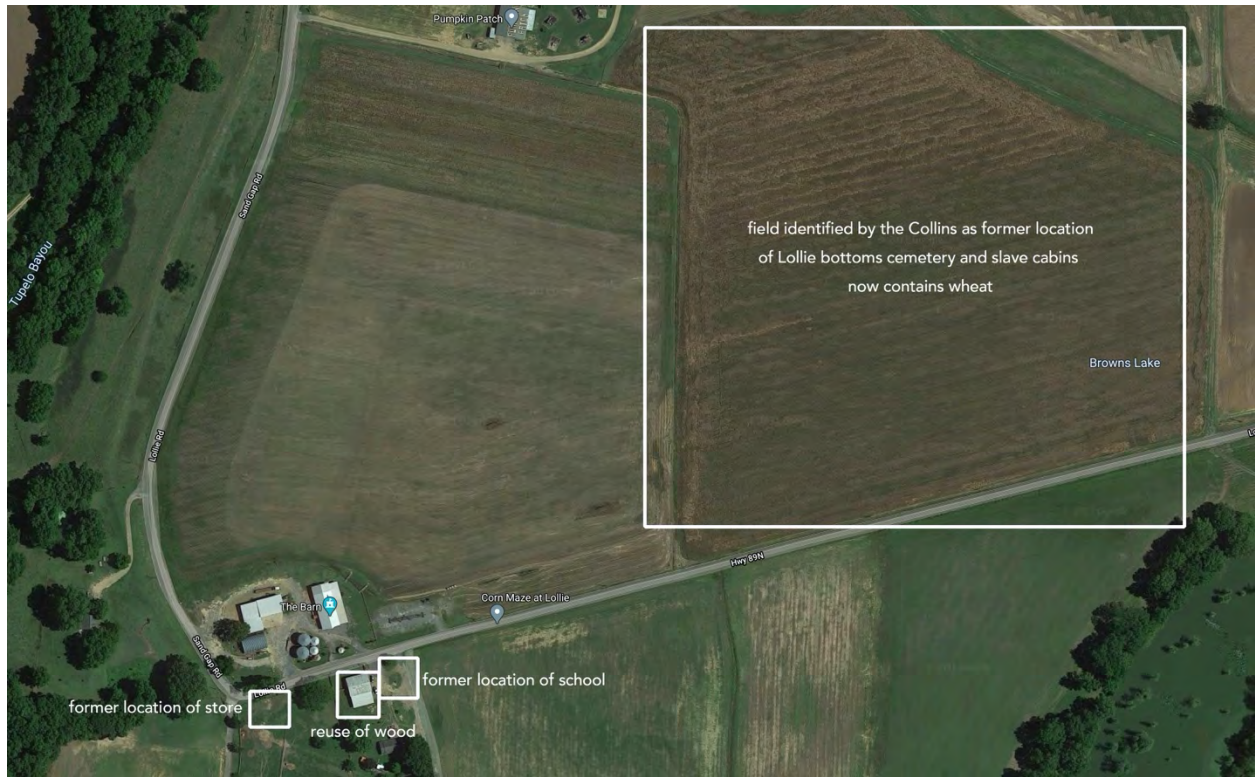
Lollie Bottoms locations