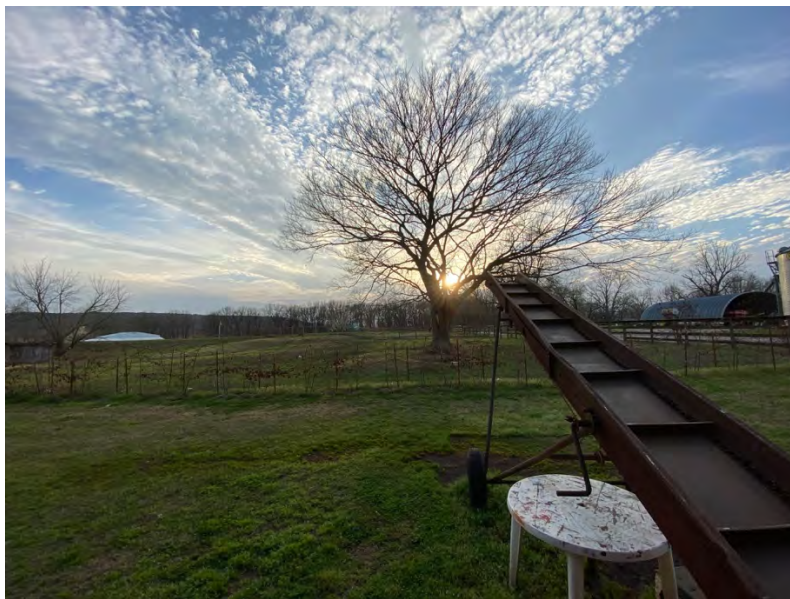
Former location of the Lollie Bottoms store (other side of this tree)