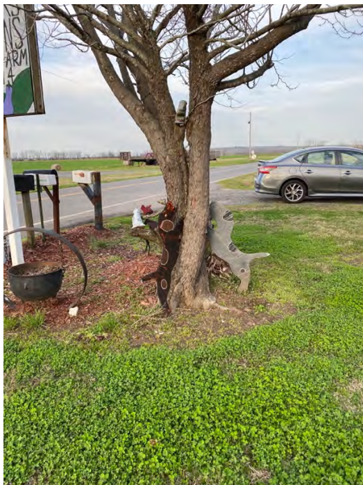
Former location of African American School