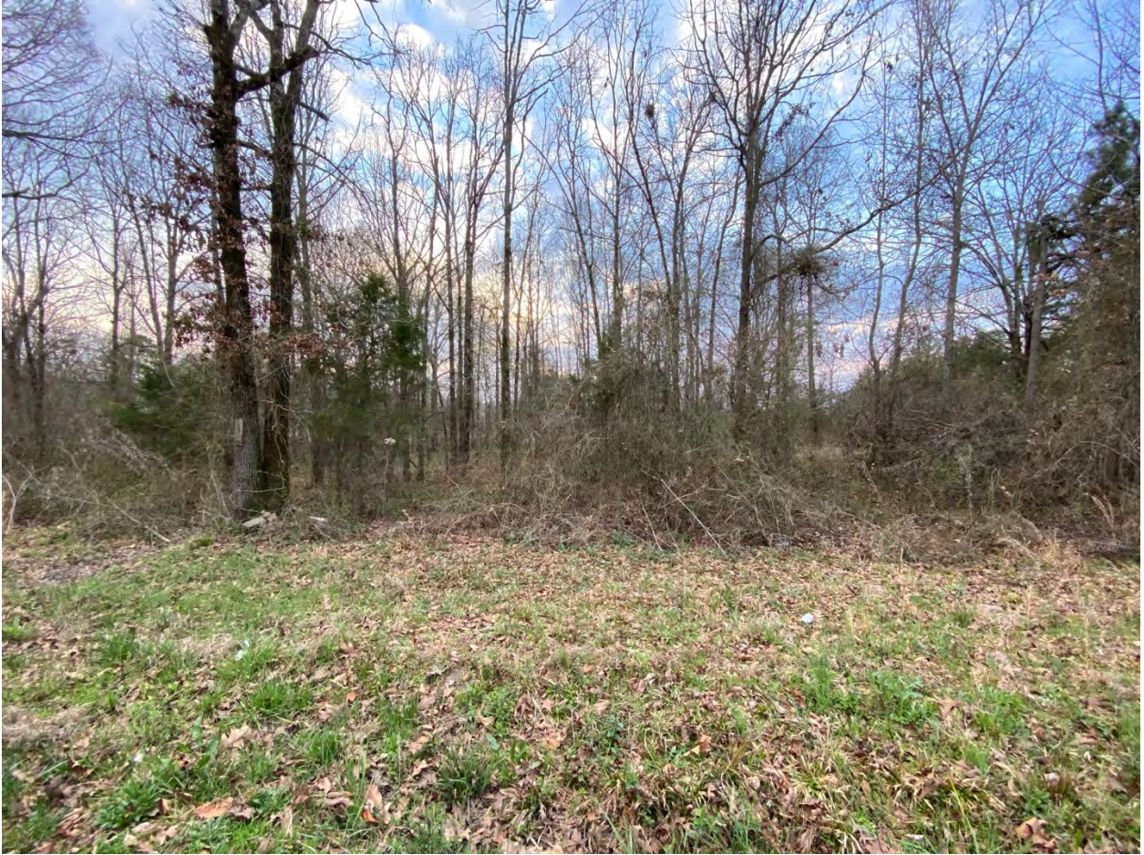
View from street