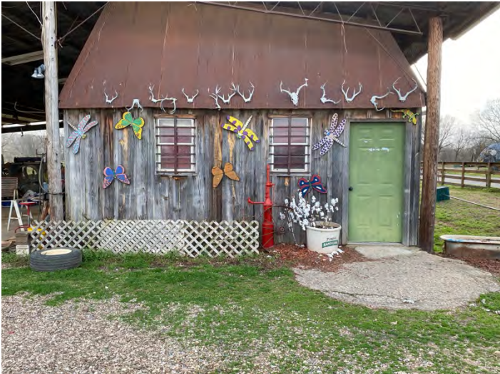
Lollie Bottoms store was torn down and the wood was reused to build this structure